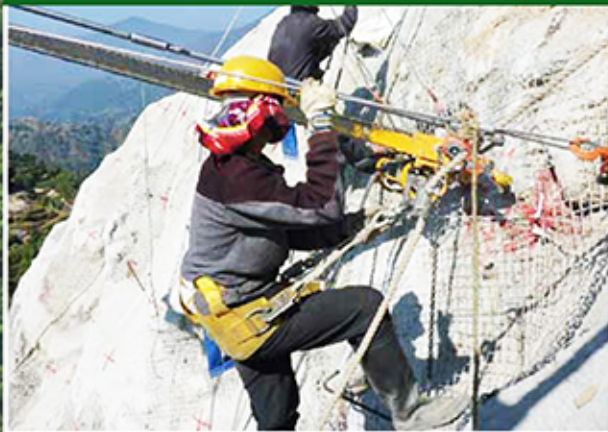
Rock drilling by wire operation