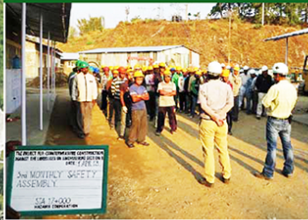
Safety management system