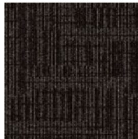
104921 DARK BROWN