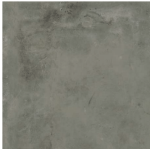
4.5 mm A00302 COOL POLISHED CEMENT