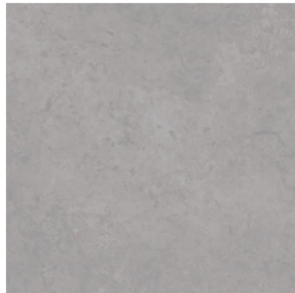
4.5 mm A00308 LIGHT CONCRETE 3.0 mm C01302 LIGHT CONCRETE