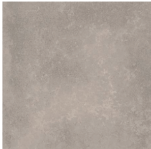
4.5 mm A00301 POLISHED CEMENT

Interface's Level Set™ Collection features luxury vinyl tile floors inspired by some of our favorite elements. A sleek, sophisticated addition to any space, each style can be paired alongside your favorite modular carpet tiles.