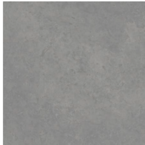
4.5 mm A00309 MEDIUM CONCRETE 3.0 mm C01303 MEDIUM CONCRETE