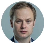
Yaroslav Yurchyshyn Member of Ukrainian Parliament