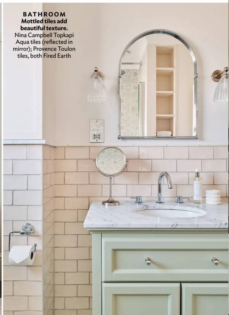
BATHROOM Mottled tiles add beautiful texture. Nina Campbell Topkapi Aqua tiles (reflected in mirror); Provence Toulon tiles, both Fired Earth

'The elegant panelling we added to the walls was a big change – it delivers a sense of character and subtle sophistication to the rooms'