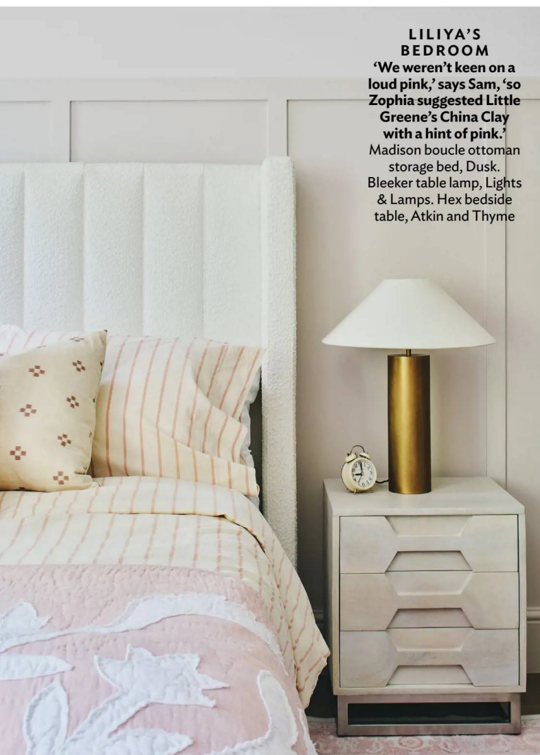
LILIYA'S BEDROOM 'We weren't keen on a loud pink,' says Sam, 'so Zophia suggested Little Greene's China Clay with a hint of pink.' Madison boucle ottoman storage bed, Dusk. Bleeker table lamp, Lights & Lamps. Hex bedside table, Atkin and Thyme