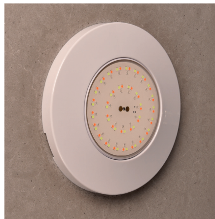
Standard finish for any type of pool. Combination of DVM100-RGB light with the PZA100-RF-WH Face Plate.