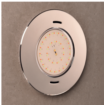
Ultra flat finish of just 2mm. Combination of DVM100-RGB light with the PZA100-FLAT-SS Face Plate Ultra Flat.