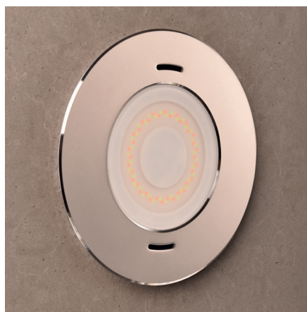
Ultra flat finish of just 2mm. Combination of DVP100-RGBW light with the PZA100-FLAT-SS Face Plate Ultra Flat.