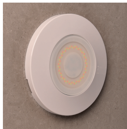
Standard finish for any type of pool. Combination of DVP100-RGBW light with the PZA100-RF-WH Face Plate.

Included in packaging: - Pro light - 2-wire cable of 2 meters - QuickConnect™ kit with Magic Nut - Retrofit kit PAR56 niche (170mm only)