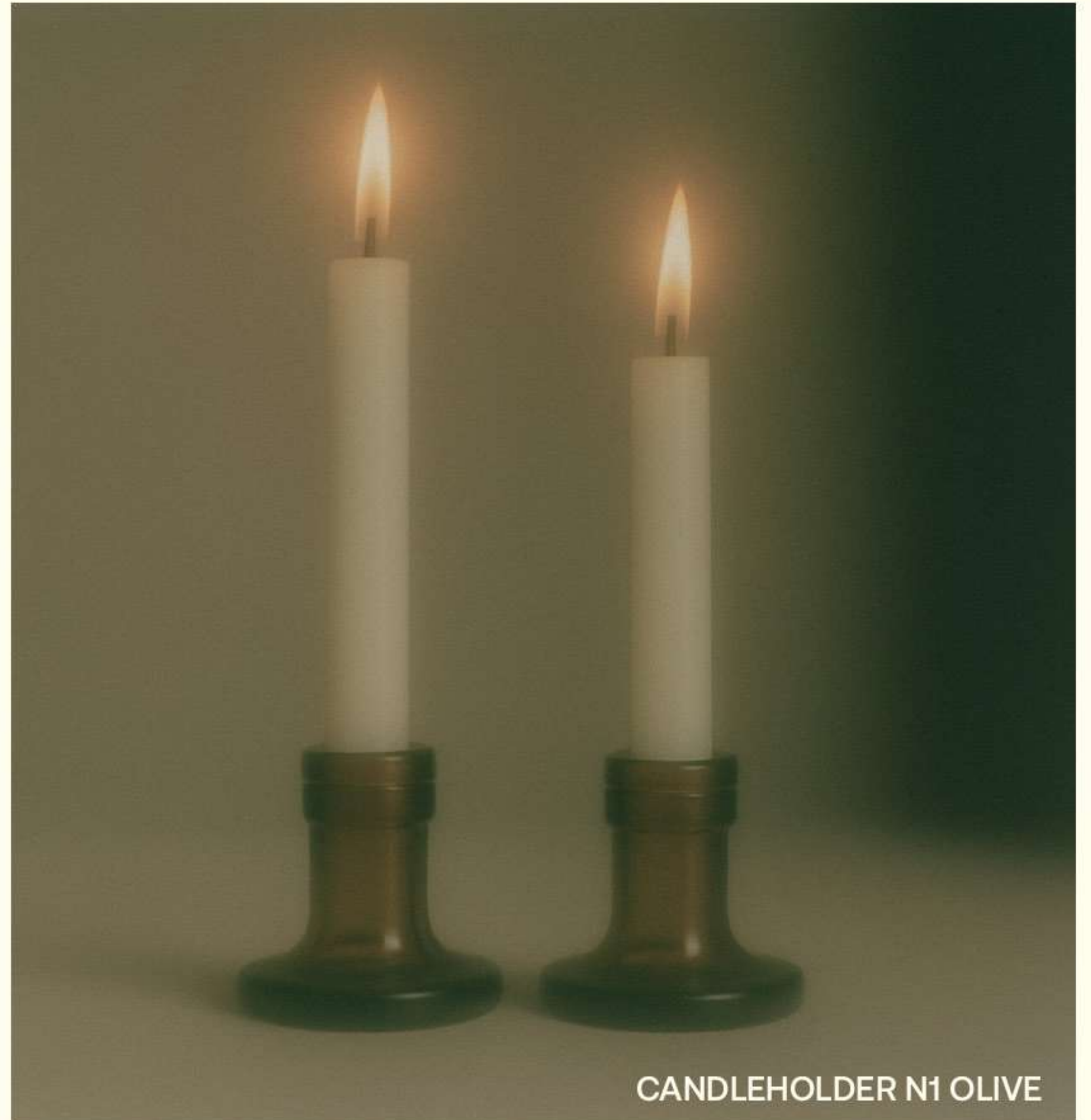
CANDLEHOLDER N1 OLIVE

[The days stretch longer, the light lingers softer. Our newest member, the rebottled candleholder. Fits effortlessly into any corner of your home, capturing that perfect in-between glow of a warm, slow evening.]