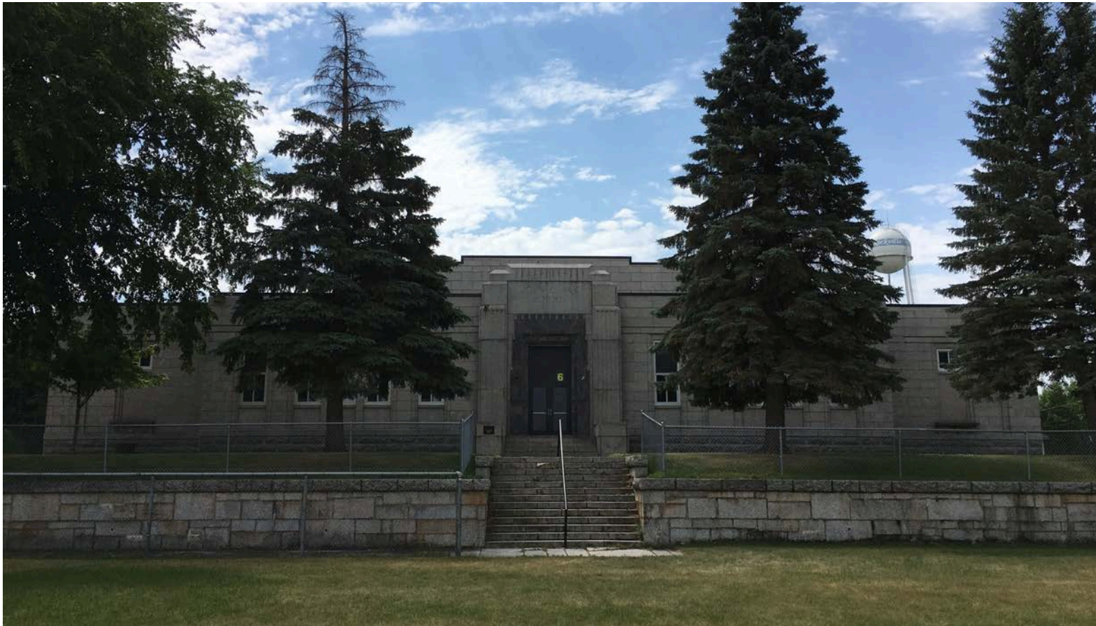
John Clark Elementary School in Rockville