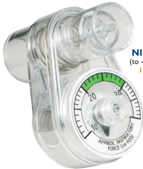
NIFometer (to -40 cm H 2 O) 10-340-00 20/Box