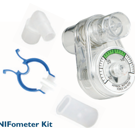
NIFometer (to -60 cm H 2 O)