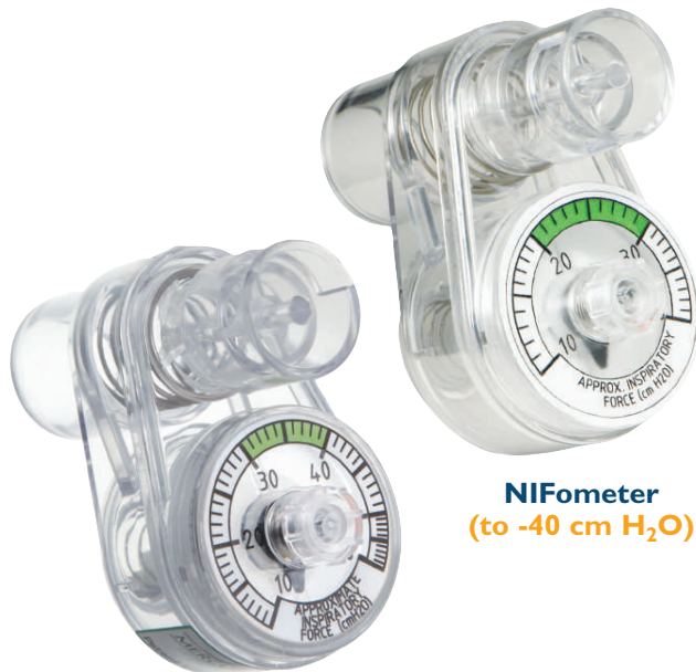
NIFometer (to -40 cm H 2 O)

The quick & convenient way to measure NIF.