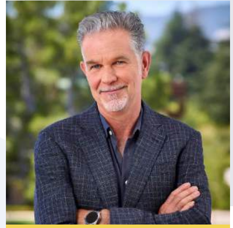
Reed Hastings Co-founder and Executive Chairman of Netflix

White Stork has now delivered more than 161,000 combat first aid kits and 407 jamming systems since the start of the war, milestones made possible in no small part by Reed's vision and generosity. We are profoundly grateful for his enduring support, and for the example he sets for what it means to stand with a free people in their darkest hour.