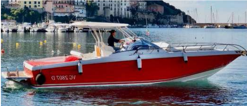
FRATELLI ROSSI - SPIDER

Prices do not include fuel, food and moorings outside Porto Ercole. Life jackets and safety equipment are provided with all boats.