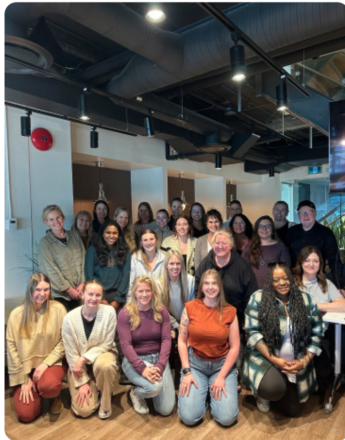
The term "abuse" is used inclusively to refer to all forms of domestic abuse, including gender-based violence (GBV), Intimate Partner Violence (IPV), Domestic Violence (DV) and other intersecting forms of harm.

We support people impacted by abuse through programs, services, education, and partnerships.