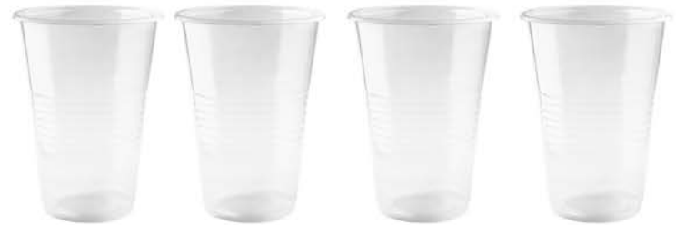
4 clear cups