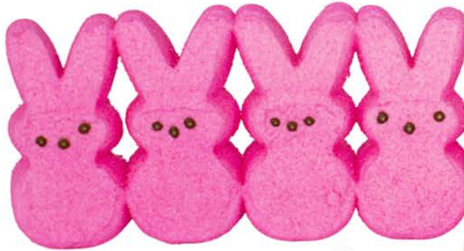
4 Peep candies