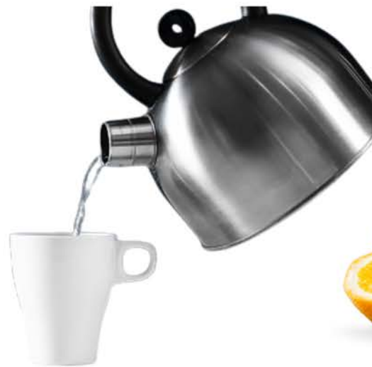
hot water (careful!!)