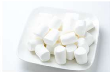
big and small marshmallow