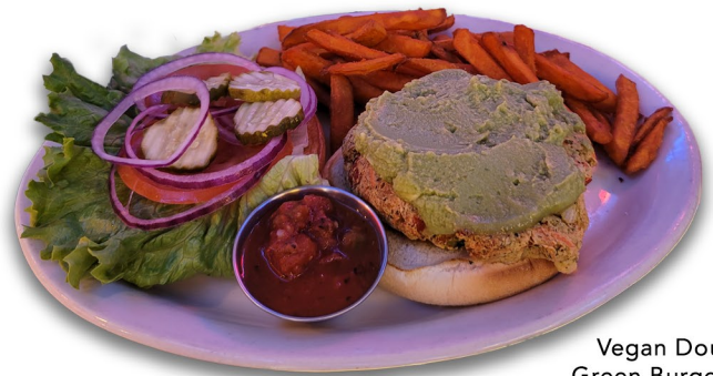
Vegan Double Green Burger (GF*)

Our very own seasoned black bean burger patty served with one side of your choice