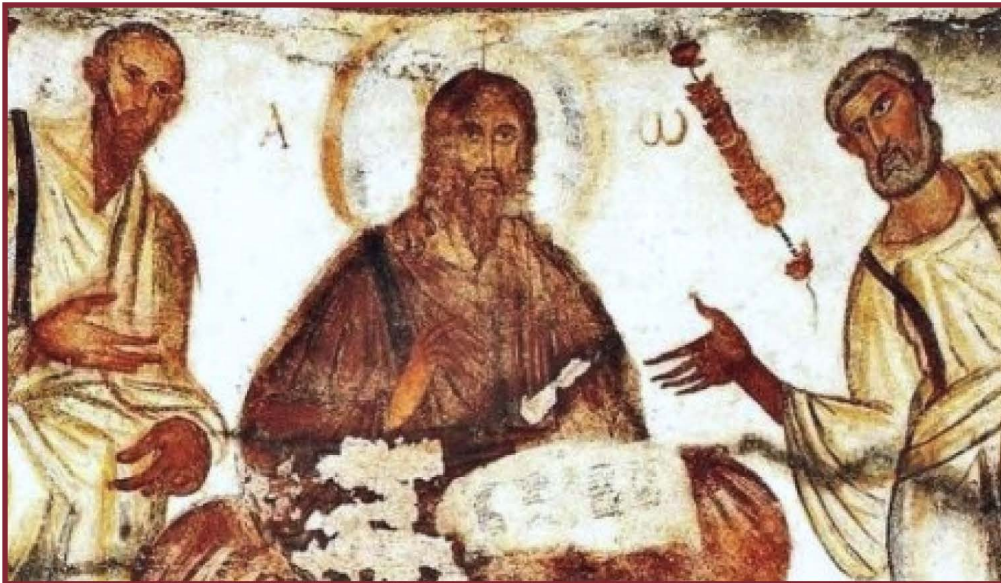
catacomb icon of Christ and Saints Peter and Paul (late 300's)

The Seventh Ecumenical Council (Nicaea II) had not been established when this commemoration began therefore it has a separate date.