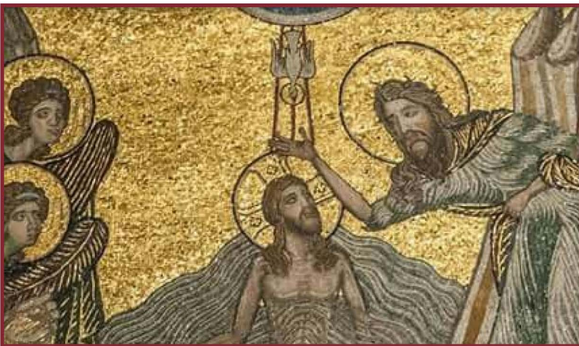
Theophany: Baptism of the Lord

T he beginning of the gospel of Jesus Christ, the Son of God. 2As it is written in the Prophets: "Behold, I send My messenger before Your face, Who will prepare Your way before You. 3The voice of one crying in the wilderness: 'Prepare the way of the LORD; make His paths straight.'" 4John came baptizing in the wilderness and preaching a baptism of repentance for the remission of sins. 5Then all the land of Judea, and those from Jerusalem, went out to him and were all baptized by him in the Jordan River, confessing their sins. 6Now John was clothed with camel's hair and with a leather belt around his waist, and he ate locusts and wild honey. 7And he preached, saying, "There comes One after me who is mightier than I, whose sandal strap I am not worthy to stoop down and loose. 8I indeed baptized you with water, but He will baptize you with the Holy Spirit."