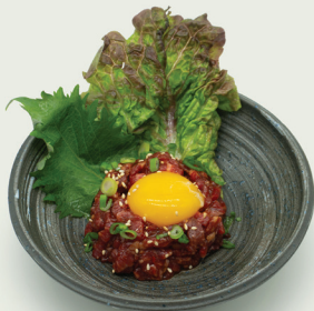
YUKKE . . . . . 13