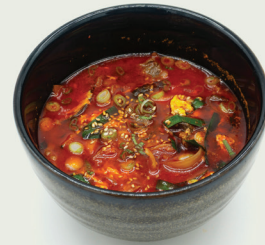
SPICY KALBI SOUP . . . . . 13