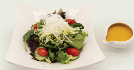
HOUSE SALAD . . . . . 9