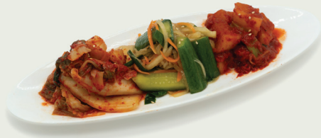
ASSORTED KIMCHI . . . . . 10