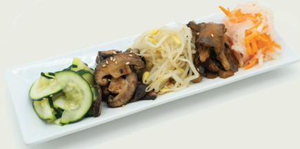
ASSORTED NAMUL . . . . . 12