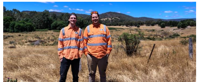
TLaWC's Cultural Heritage team

As our operations evolve, we look forward to finding new ways of working together.