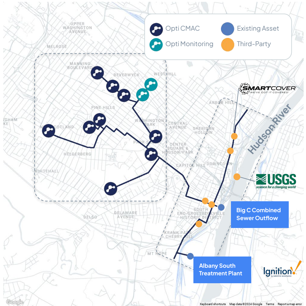
Albany Smart Watershed Network