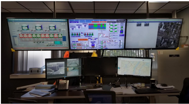
NHSA SCADA Room. Operators manage upstream stormwater assets & wastewater treatment systems together.

With Opti active controls, a building's detention tank could be downsized by an estimated 30% and continue to meet NHSA's volume capture requirements. This smaller, more efficient storage approach saves money and space in constrained projects. Opti's continuous monitoring and adaptive controls (CMAC) is now the primary smart active controls solution used by area developers.