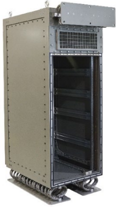
Figure 3 Optima MB Series Rugged Bolt-Together Cabinet

Outcome: The rugged MB-Series enclosures enabled deployment of the new SPY-6 radar suites on frontline warships with confidence. These shock-qualified cabinets have been delivered since 2018, providing mission-critical reliability in all conditions. The modular enclosures optimized performance and ensured the Navy's next-gen radars remain operational after violent shock events, all while simplifying integration and future upgrades. This success highlights Optima Stantron's ability to combine versatility and hardened engineering to meet stringent military standards and fleet requirements.