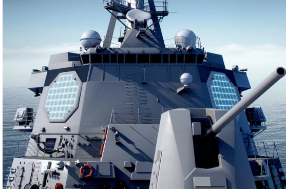
Figure 2 Advanced Naval Ship showing SPY-6 Radar

Solution: Optima Stantron delivered an “MB” Series Modular Bolt-Together cabinet system with shock-isolation mounts on each bay. The weld-free modular design eliminated stress points, allowing the cabinet to absorb extreme shock vibrations instead of transmitting them to sensitive radar electronics. Each bay was equipped with integrated heat exchanger units to dissipate heat from processors and RF gear. The enclosure’s aluminum framework provided a strength-to-weight advantage, and gasketing ensured shielding effectiveness for EMI control.