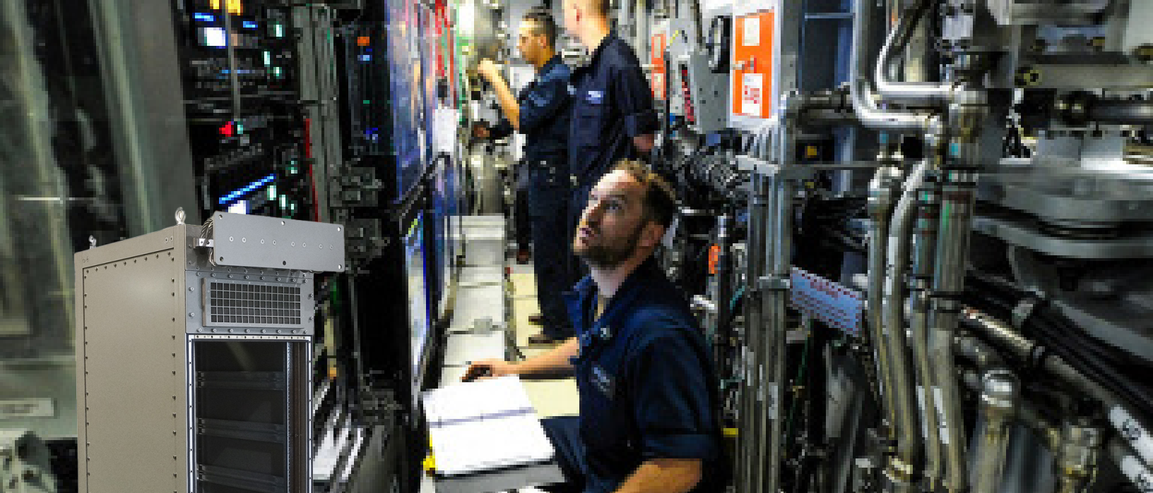
Figure 1 Rugged and Shock Isolated TIDS Cabinet