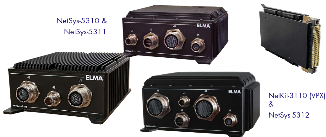
Figure 2: Expandable NetSys family of rugged boxes have tailored I/O integration enabling a wide range of quick turn solutions.

Products based on the Cisco ESR6300 feature a host of powerful network and security features, including a quad-core ARM processor, hardware-accelerated encryption, trusted boot, and firewall functions. Elma enhances this with the addition of scalable Ethernet port counts, alarm and zeroize inputs, and in some configurations Power-over-Ethernet. Such additions enable easier customization and more cost efficient future expansion.