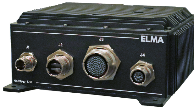
Figure 3: Cisco's Linux-based software router opens the door to custom packaging designs suitable for any deployed space.

a tiered approach so that the end application gets the features and functionality it requires to accomplish its mission. Elma's rugged Cisco-based product line currently consists of three compact, fanless routing boxes known as the NetSys-5310, -5311, and 5312, each with increasing port counts and features (such as Power-over-Ethernet), and the modular OpenVPX-based NetKit-3110 plug-in card. Each of these products offers a matrix of Cisco software (six packages in all) to provide the system integrator with exactly the right mix of performance and features.