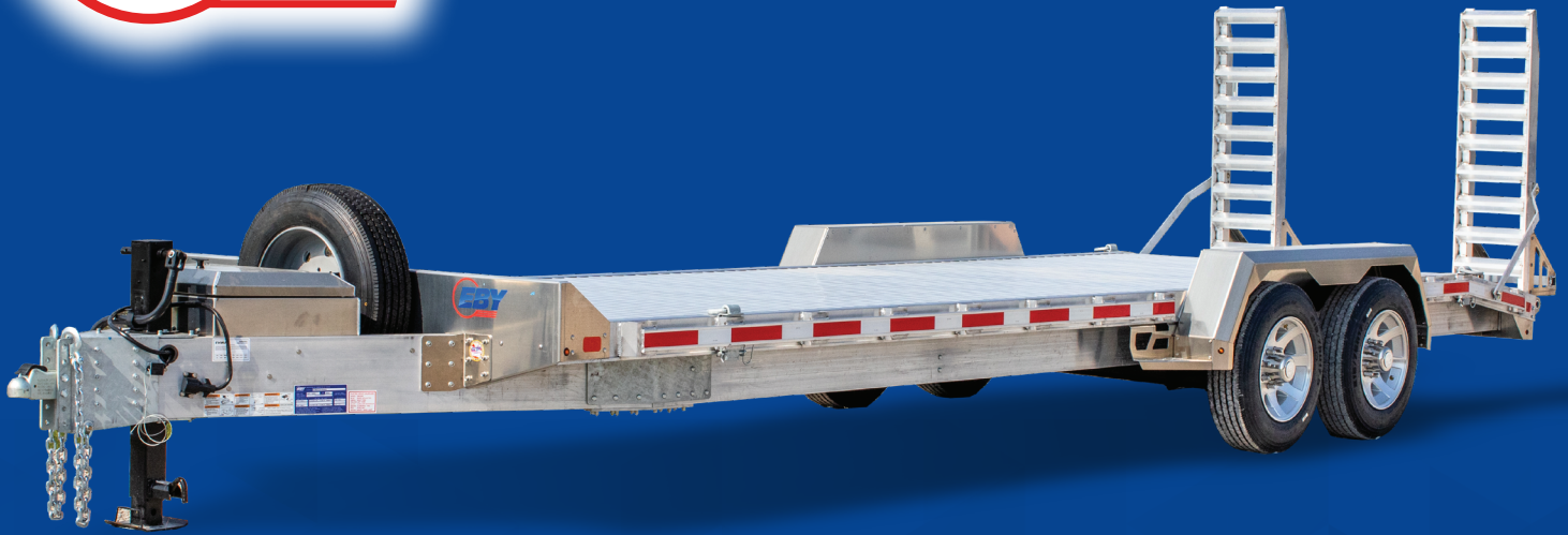
14K Low-Profile (shown with optional equipment)