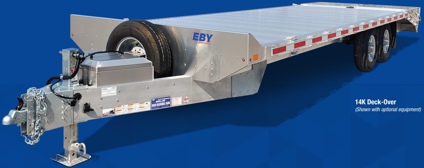
14K Deck-Over (Shown with optional equipment)