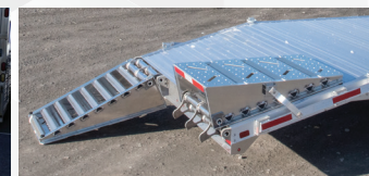
(2) 1/3 fold-flat