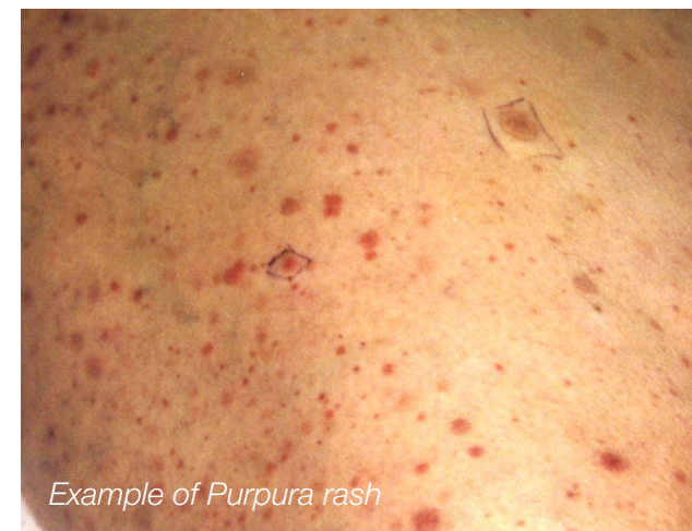
Example of Purpura rash