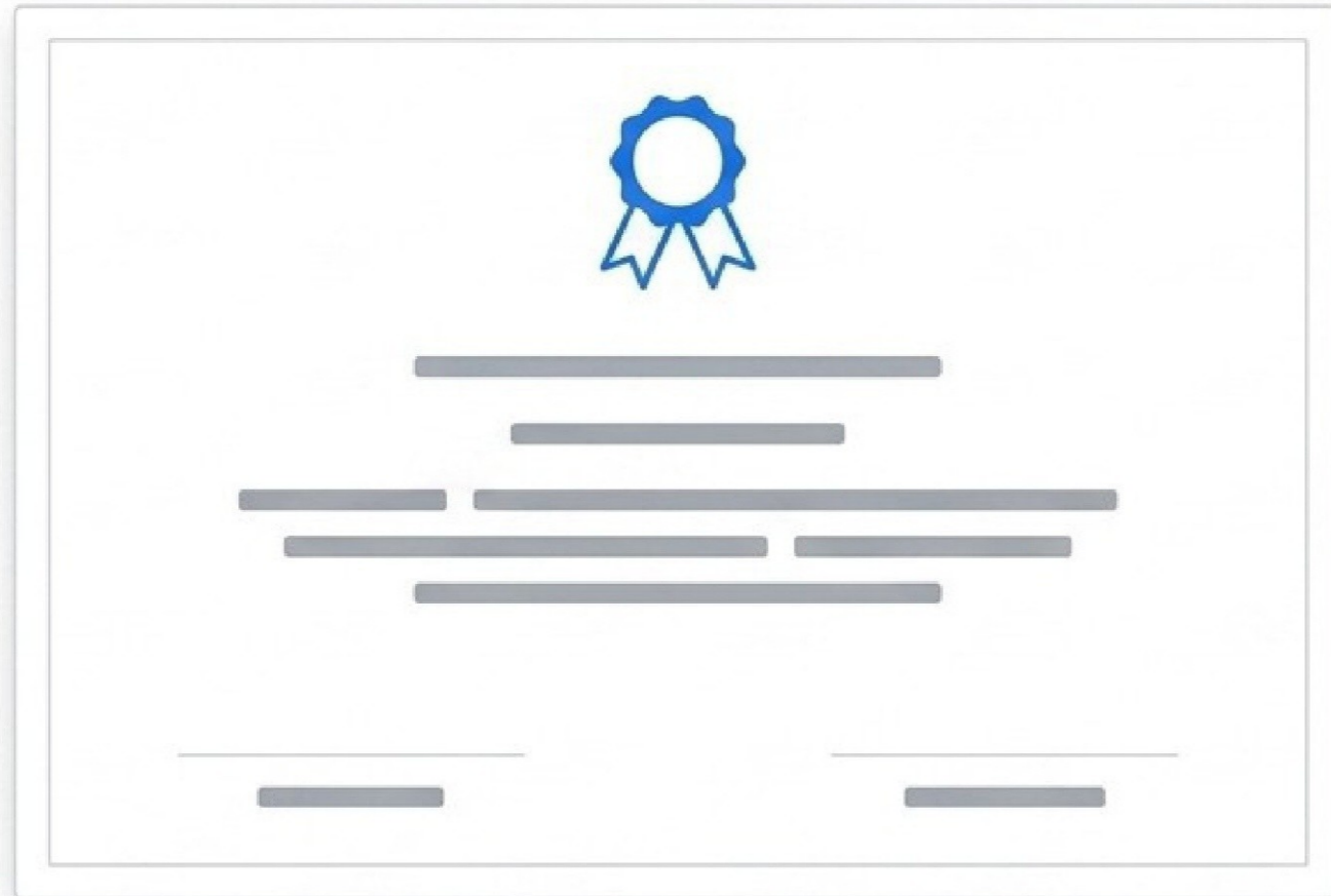
Edstellar Course Certificate (Validating Acquired Skills)