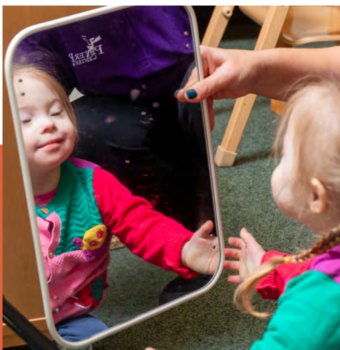
The Peter Pan Centre for Children with Special Needs

Since True Colours was founded in 2002, we have always listened to those from the sectors in which we work, and designed programmes in collaboration with those we fund. Increasingly, we are now working directly with families, and those with lived experience, to ensure our funding is informed by their experiences.