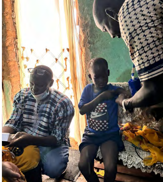
Hands on Care, the Gambia, via APCA

The tireless work of our partners in Africa is making a real difference to the lives of patients and their families. We are proud to be able to support their work.