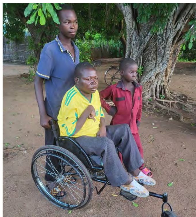
Palliative Care Association of Malawi

The Trust's main portfolio appreciated in value over the past 12 months, producing a total return net of all costs of 1.0% which was just ahead of the composite benchmark return of -0.1% (as at 05 April 2025). The Reserves portfolio produced a total return net of all costs of 3.4% which was slightly behind the composite benchmark return of 3.5% (as at 05 April 2025).