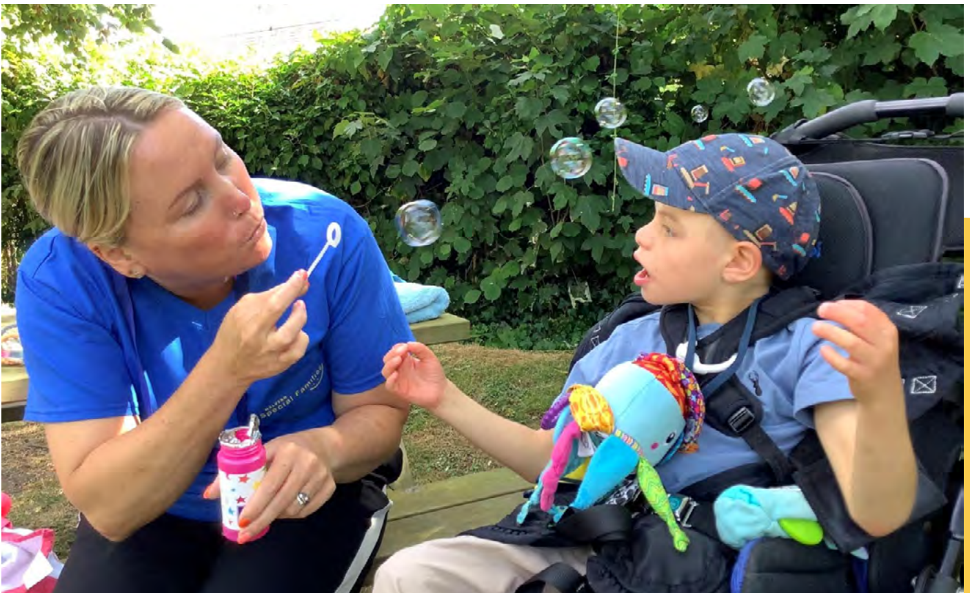
Malvern Special Families

True Colours' registered office is The Peak, 5 Wilton Road, London SW1V 1AP.