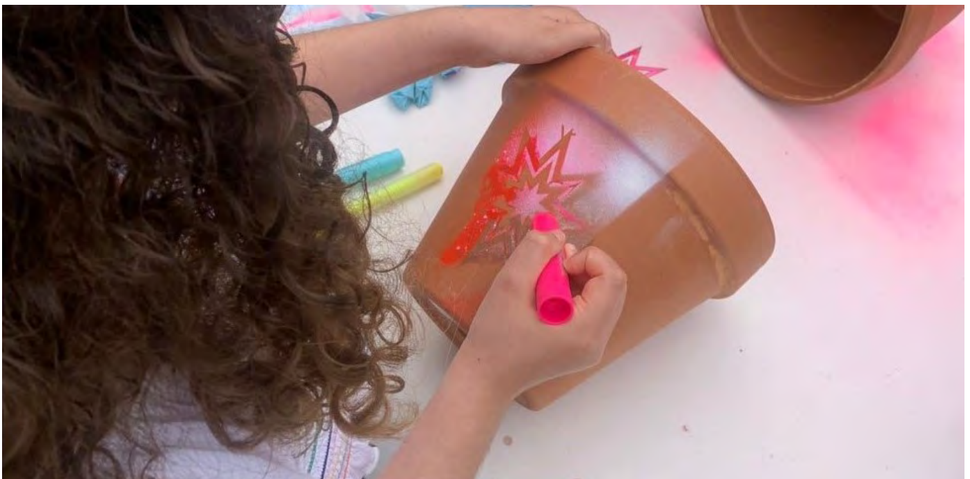
SLOW – Surviving the Loss of your World

We are hopeful that the proposed introduction of a single unique identifier for children would solve all these issues, if all children and young people were included. We also hope that this project will demonstrate the value of such an identifier as it will result in agencies being better able to identify needs in their population, to better meet those needs and to develop cost-effective interventions to improve outcomes for children. In the interim, the team has produced a toolkit which will provide guidance to others about how to tackle the current challenges around data sharing.