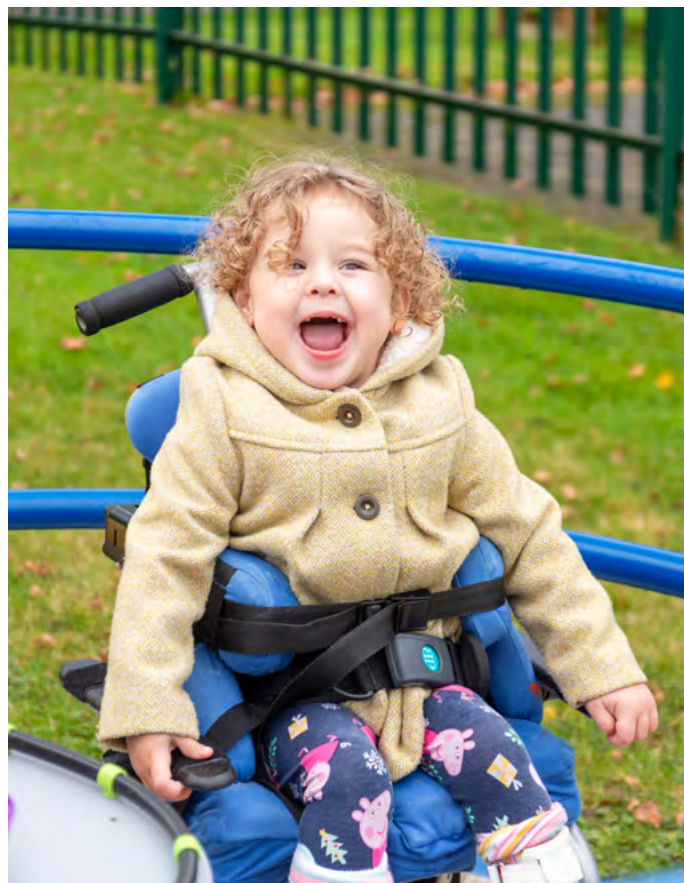
The Peter Pan Centre for Children with Special Needs