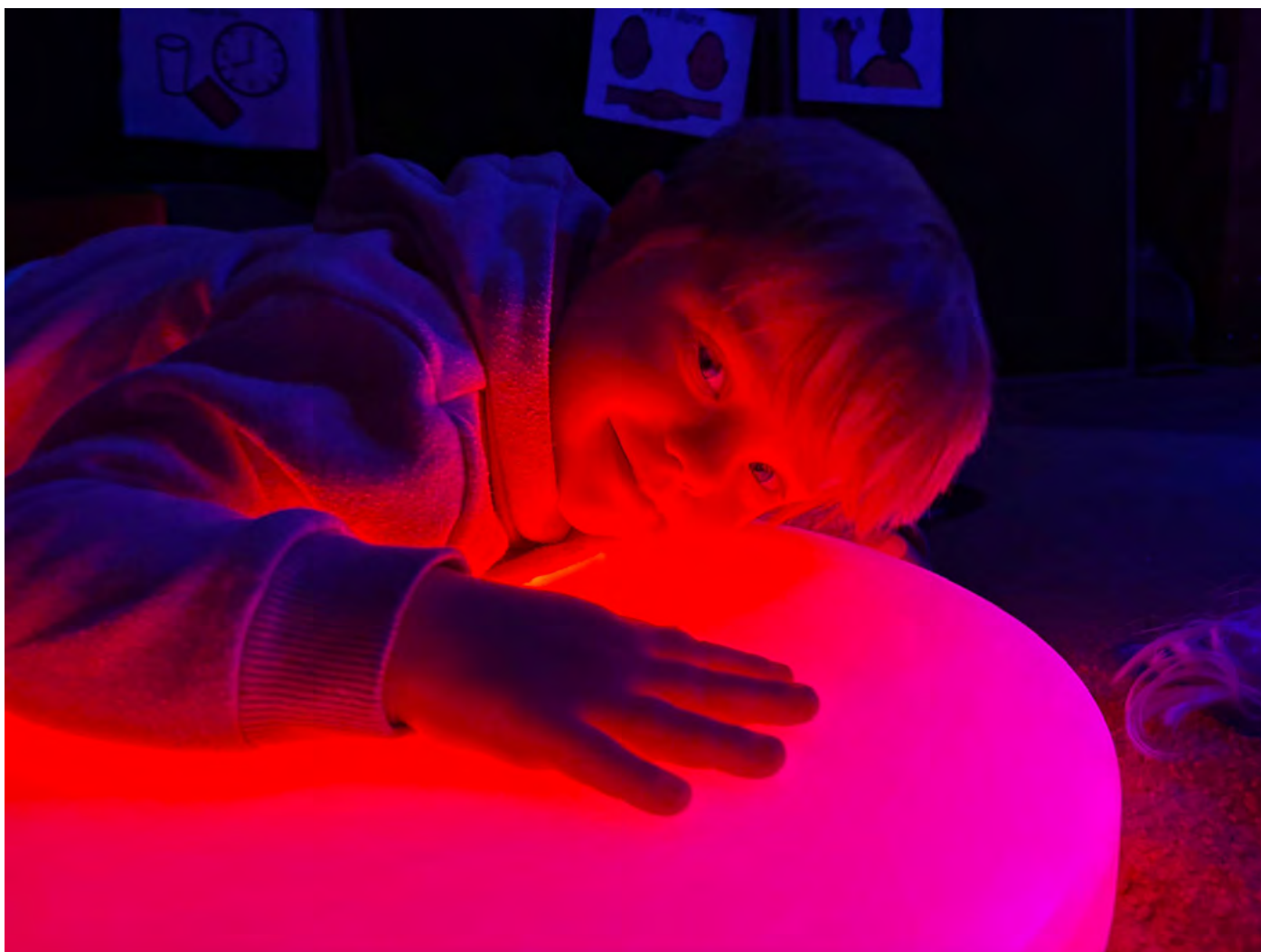
The VIP Club

At True Colours, we believe that parents are truly the champions in their child's care so it is vital that their voices are heard in research and by those who are designing services. We were, therefore, pleased to make a grant to the Institute this year to cover the costs of employing a new parent-chair to lead its family advisory board, a group of parents who work with the research team to provide input on the Centre's work. We agreed with the Institute's view that this role should be a paid position, recognising the expertise that parents bring. This work has been informed by a previous project funded by True Colours at the University of York which identified best practice approaches for engaging groups of parents in research.