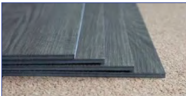
Luxury Vinyl Plank (LVP)