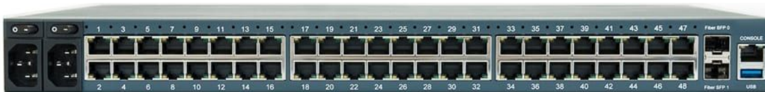
Nodegrid Serial Console - S Series (Rear)