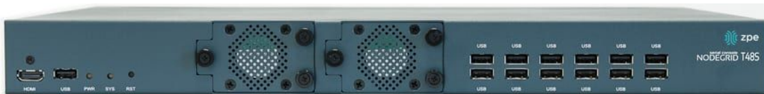
Nodegrid Serial Console - S Series (Front)