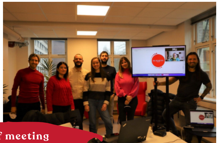
Kick-off meeting COPENHAGEN