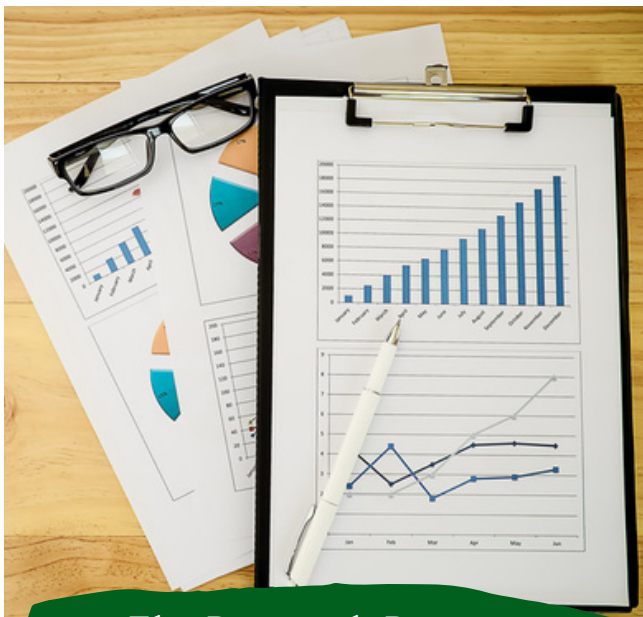
The Research Report

From February to June 2022, the Consortium implemented a desk and field research focused on the achievement of SDGs for SMEs in partner countries and the existing C-VET training offer on the topic of environmental sustainability.