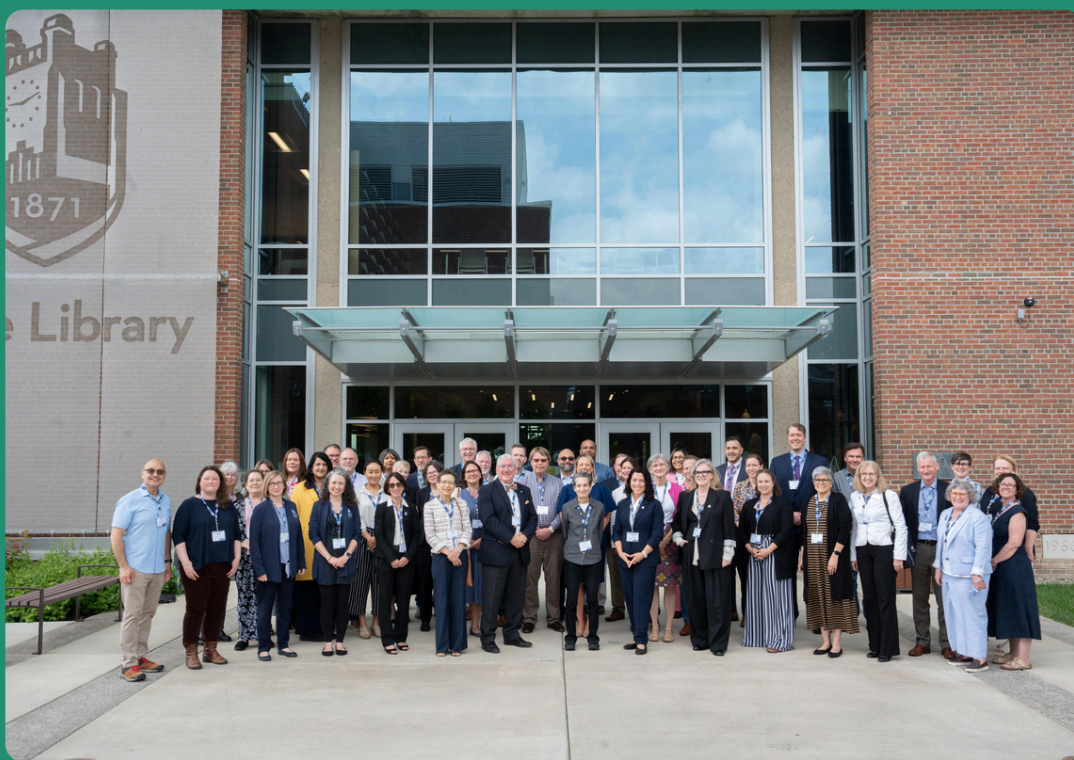
Summer Summit Participant Photo

This year's COPLAC Summer Summit, hosted by SUNY Geneseo, was a vibrant gathering focused on community building, education, and networking. The event was held on June 8-9, on the SUNY Geneseo campus immediately following the Annual Board Meeting.