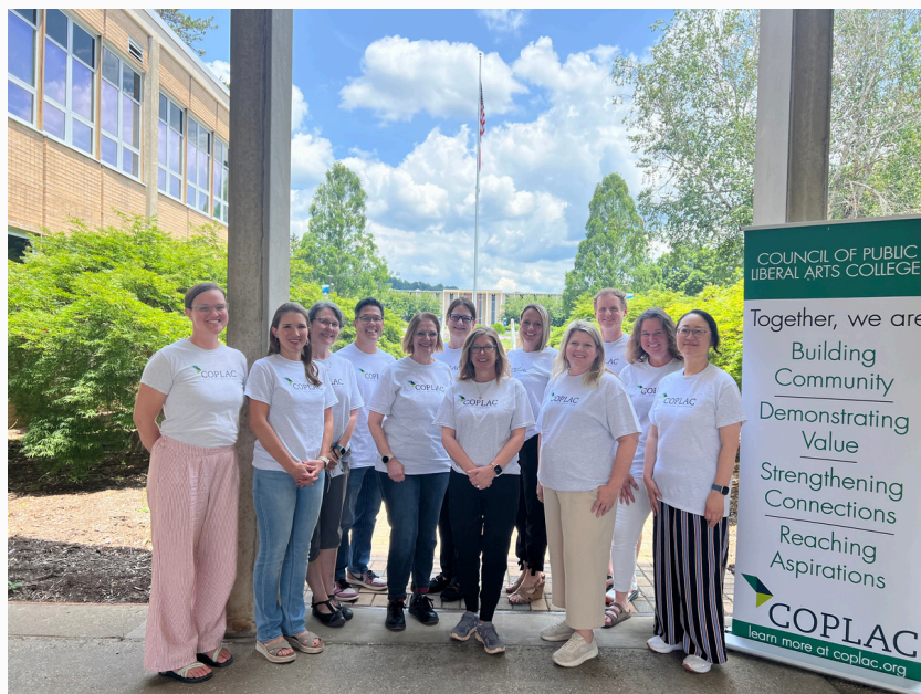
Health Studies Cohort 2025 pictured with the Planning Team

The Annual Summer Institute occurred at the University of North Carolina Asheville from June 19-21. The event attracted 10 participants from 4 COPLAC member institutions, each representing academic roles in various Health Studies fields. The event culminated in a field-specific SWOT analysis, which has been openly shared with COPLAC board members and Chief Academic Officers. The document may be reviewed by COPLAC members here .