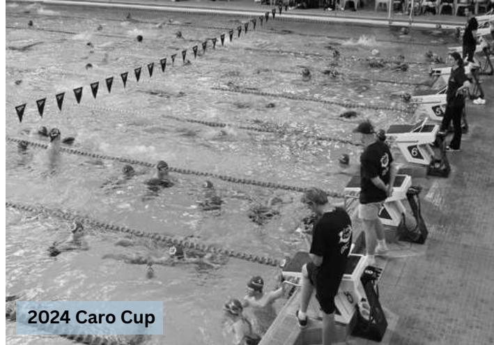
2024 Caro Cup