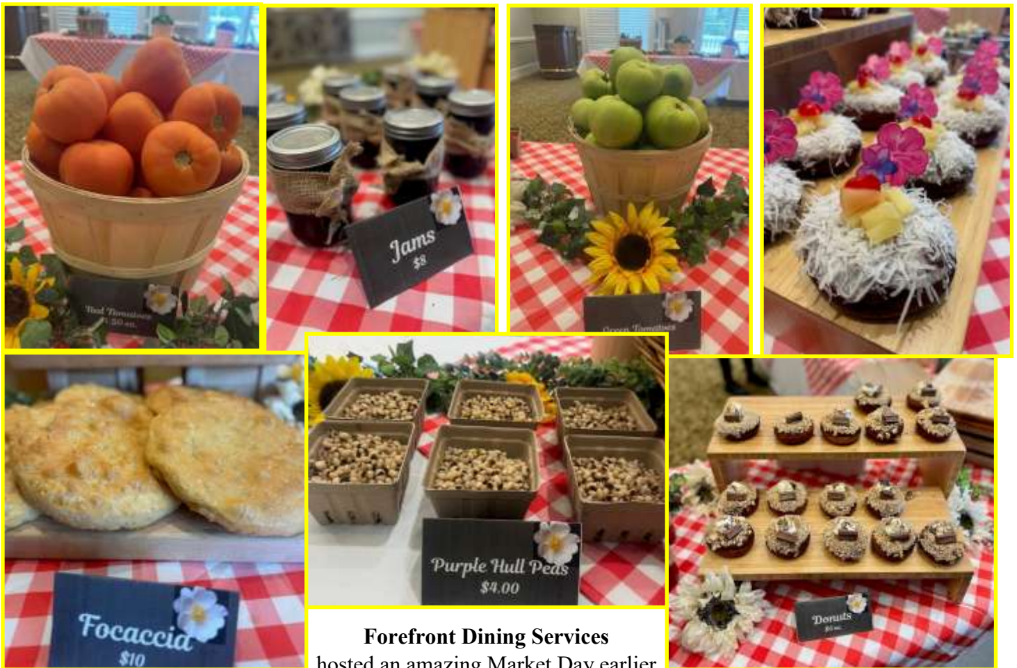
Forefront Dining Services hosted an amazing Market Day earlier

this month which included fresh peas, tomatoes, green tomatoes, fresh baked breads, homemade jams by chef Marc, beautifully created specialty doughnuts that were divine and so much more!