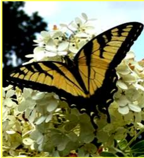
Pat Haney literally stalked this butterfly for 20 minutes, until he landed and she could take this amazing photo! He was on a flower bush in the parking lot