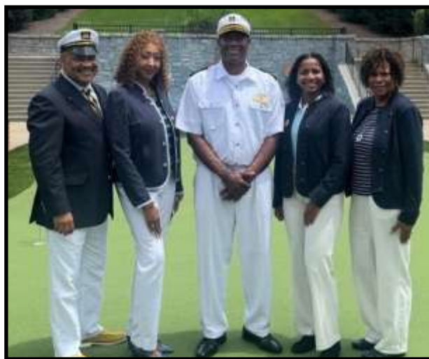
Captains and Your Dining Crew