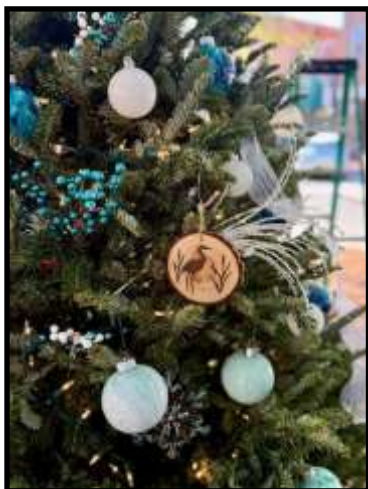
Custom ornaments made by residents

Visit Piedmont.org/ColumbusWeightLoss to learn more about weight management options, and our comprehensive program.