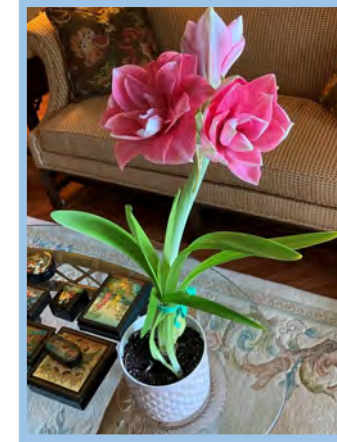
Perfectly Pink! Gail Jebavy's pink amaryllis is beautiful!