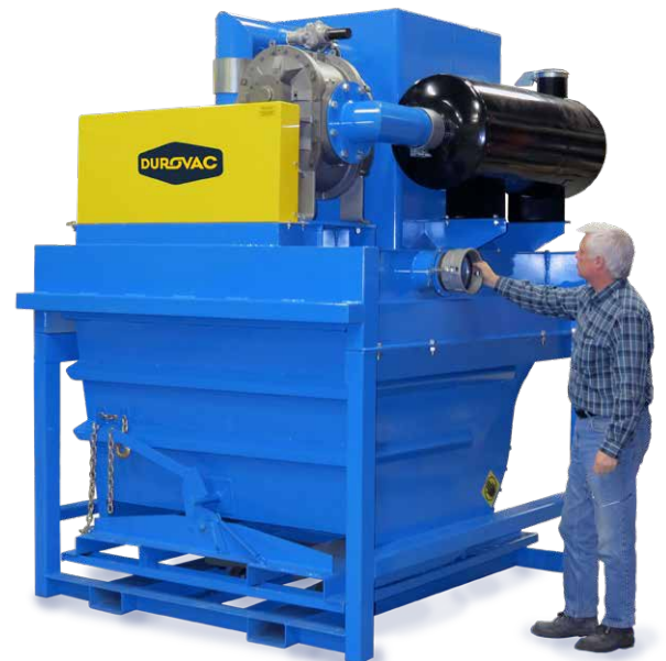
The PowerLift® industrial vac solves your large cleaning problems. Here is a 75 Hp with a 2.5 yd 3 hopper.

Let us help you select a durable industrial vacuum that just keeps on working.