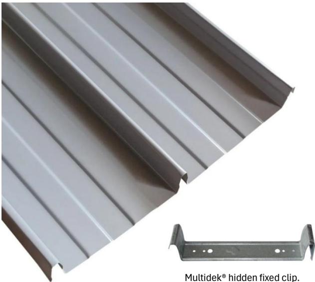
Multidek® hidden fixed clip.