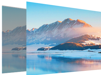
*For LIP design and specific config. only

Tailor-made LEDs for ultra-high brightness and stability; high clarity and contrast ratio image under direct sunlight for maximum advertising effect.