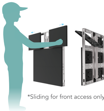
*Sliding for front access only

Lightweight cabinet, over 60% lighter than ordinary; patented sliding structure and fast-lock simplify the work for time & cost saving.