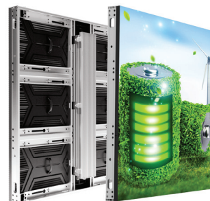
*For specific config. only

Ultra-low consumption with a max 25% reduction, based on deep customization on circuits, lower operational costs and higher ROI