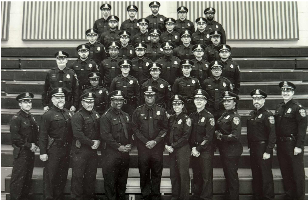
Milwaukee Police Department Recruit Class 2-2024