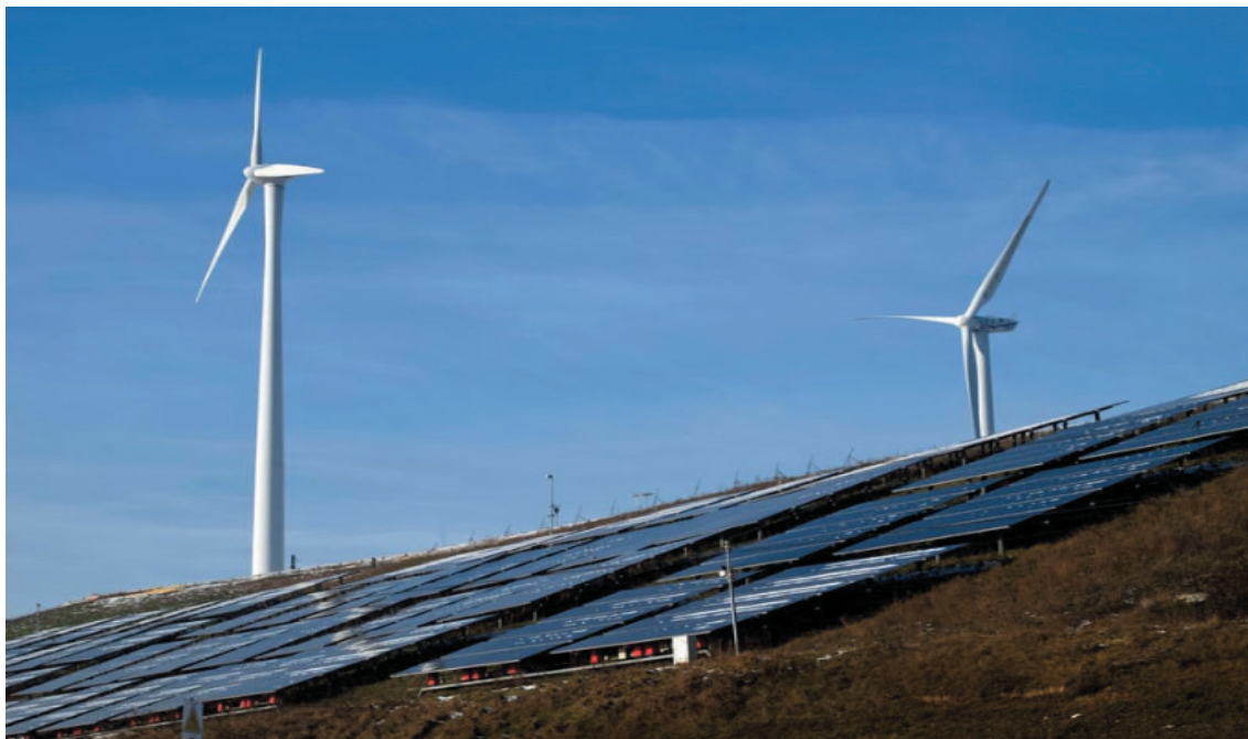
Rapid integration of renewable energy: PV and windturbines

Ingenium NV designs the technical and contractual architecture of your site to make flexibility work.