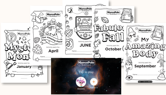
Annual Membership to MarcoPolo World School