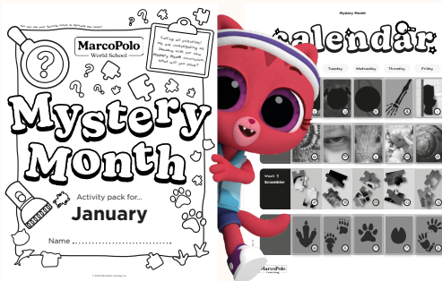
Monthly Downloadable Activity Packs