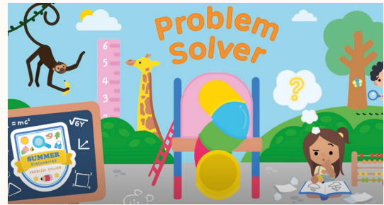
Summer Transition Program