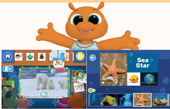
Hundreds of Learning Videos