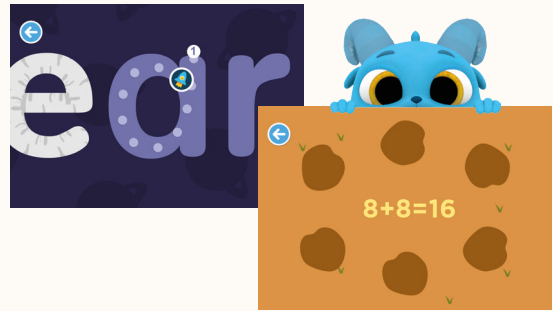
Thousands of Literacy and Math Games