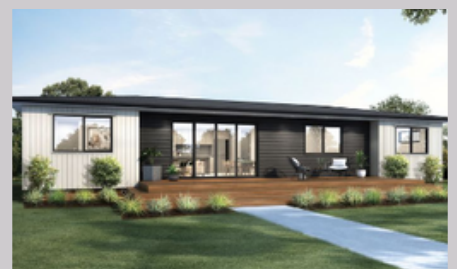
The Growing Family Home