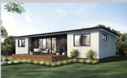
The First Home