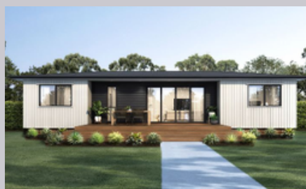
The Family Home