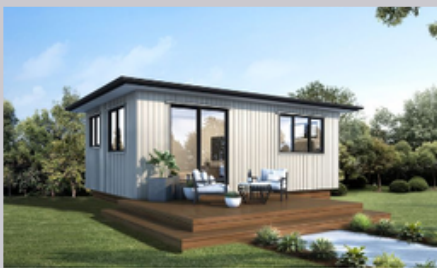
The Tiny Home