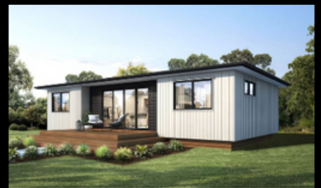
The Investor Home