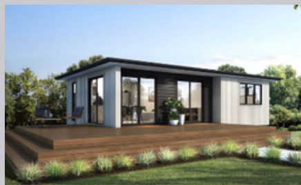
The Starter Home