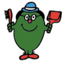
LITTLE MISS NEAT