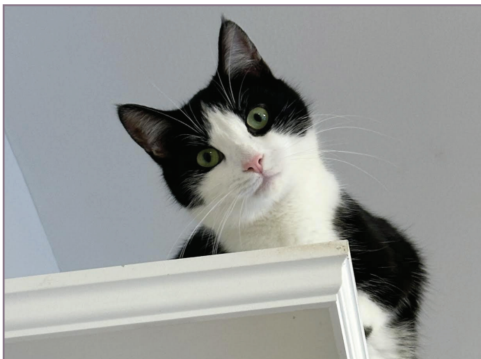
Oreo looks down from on high.

The eight original members of Pet Pride's Shy Cats Club watched and waited as the seasons came and went. Their sweet faces became familiar to staff and volunteers, but visitors might never have known they were here. When the shelter bustled with activity, Oreo escaped to the uppermost cubbies of the Community Room. Lynette tucked herself into drawers and cabinets. Adopters passed these cats by or never saw them at all.