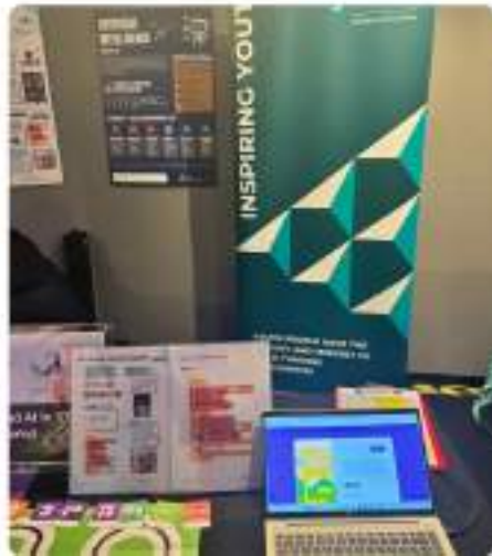
DiscovHER Science Centre - G6-10 Girls