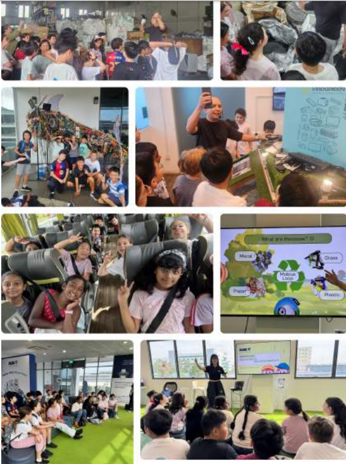
G4 Field Trip to ALBA Recycling Centre 9th Mar 2026