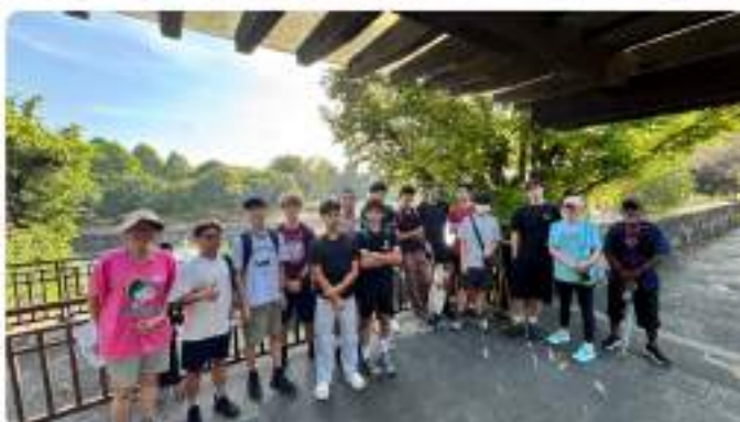
Chek Jawa Trip 12th Mar 2026