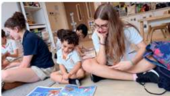
Buddy Reading 6th Mar 2026