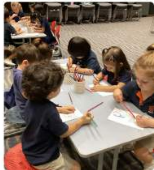
Book Week: Author Talk 16th - 18th Mar 2026