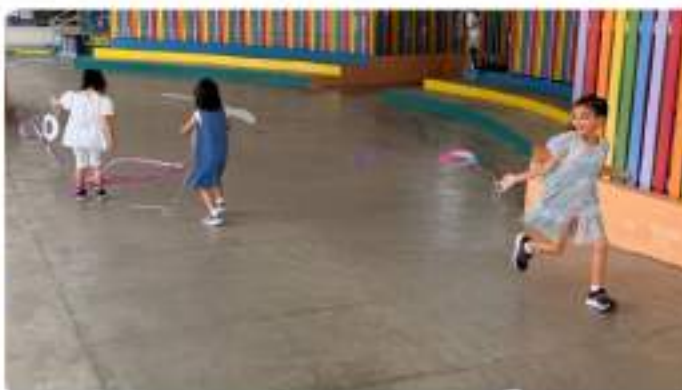
K1 Paper Kite Making 13th Mar 2026