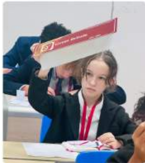
Yale Model United Nations Singapore 2026 13th & 15th Mar 2026