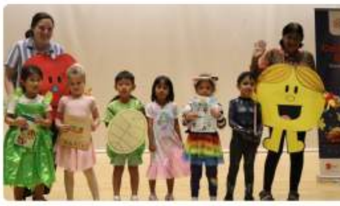
Book Week: Assembly 19th Mar 2026