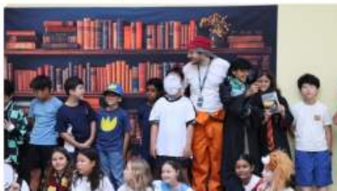
Book Week: Dress Up Day 19th Mar 2026