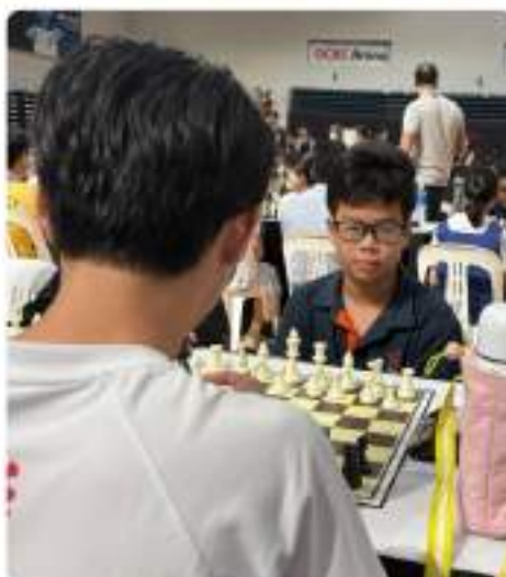
77th National Schools Individual Chess Championship 2026 16th - 17th Mar 2026