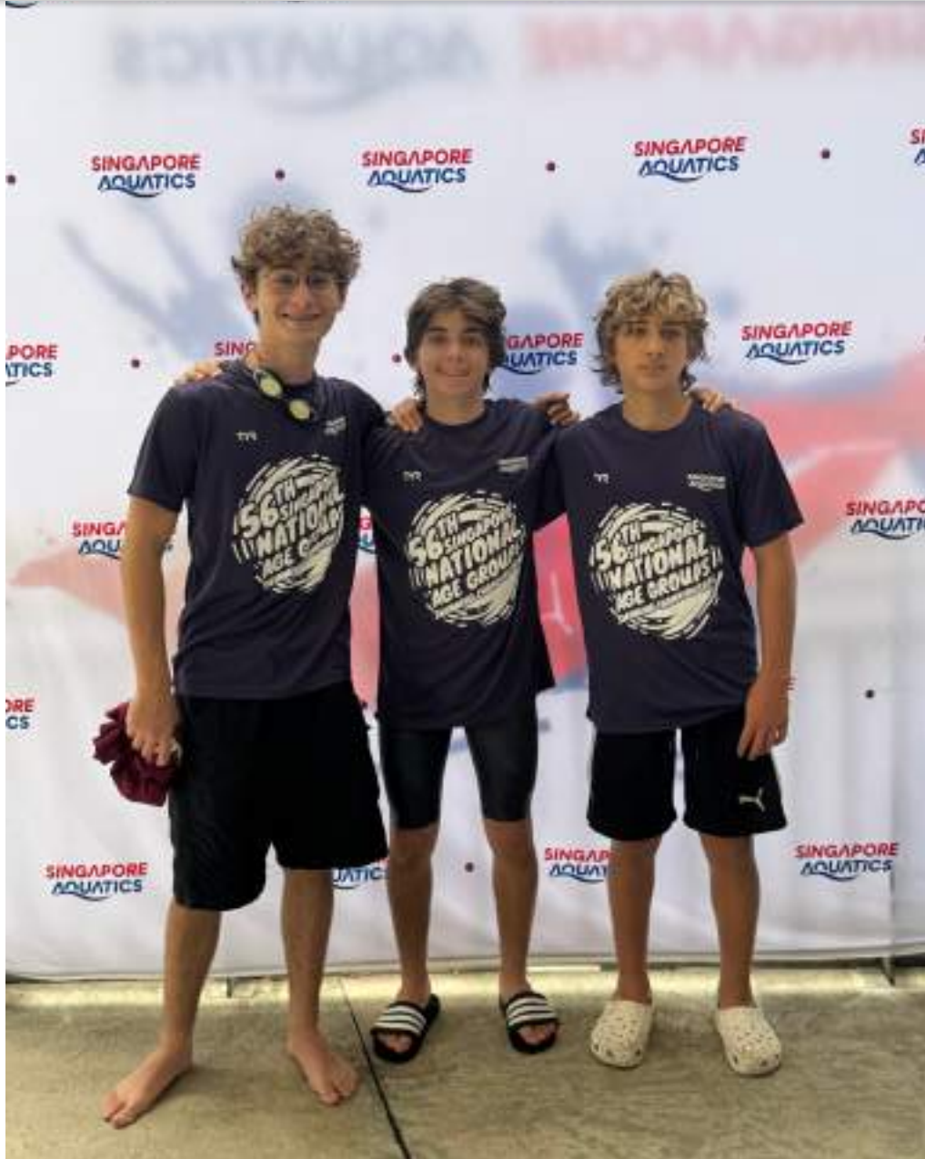
56th Singapore National Age Group 2026 Swimming Competition 15th Mar 2026