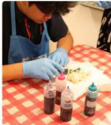
Students Project: Tie-dye matza/afikomen bags 17th Mar 2026