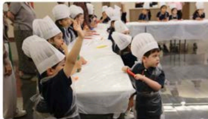
Matzah Bakery 23th Mar 2026