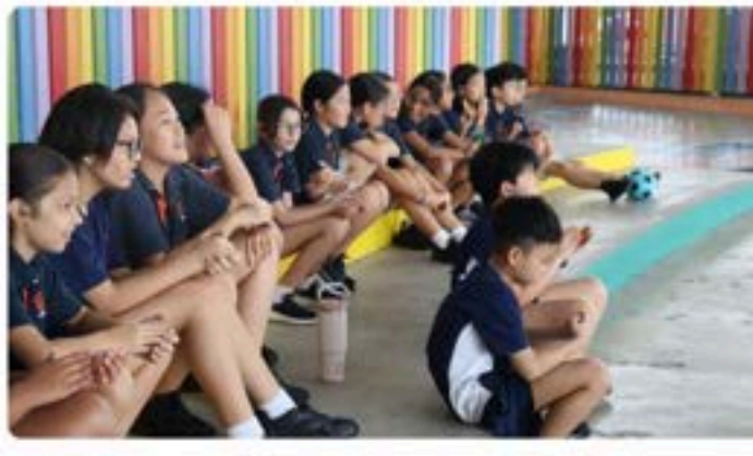
Open Mic 23th - 27th Mar 2026