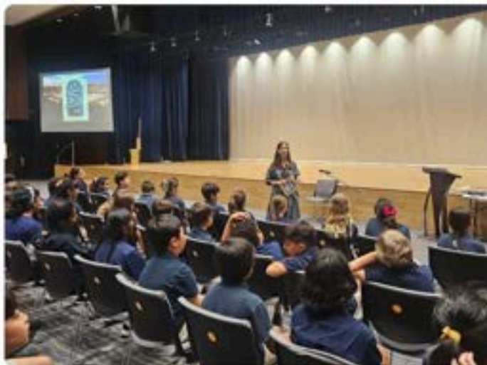
Mimouna Event 24th Mar 2026