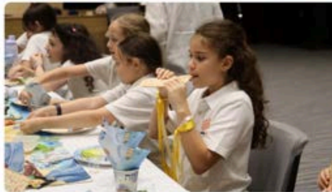
Pesach Seder 25th Mar 2026