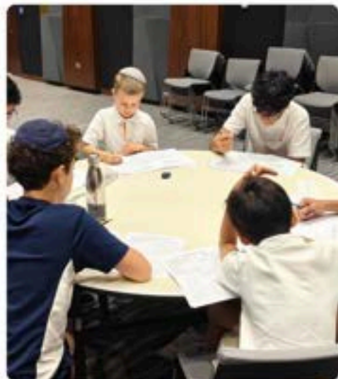
Singapore Maths Kangaroo Competition 27th Mar 2026