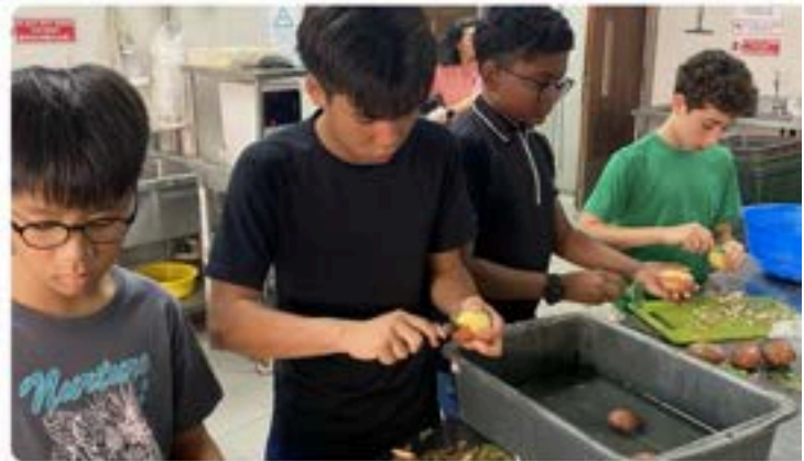
NYAA Willing Hearts 25th Mar 2026